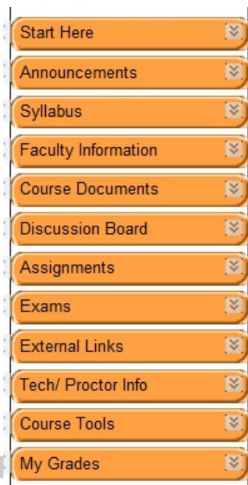
Figure 1. Online course menu.